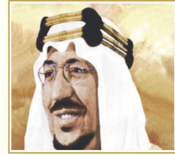
King Saud ibn Abdulaziz Al-Saud -may Allah's mercy be upon him-