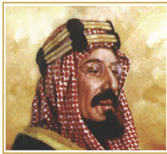
King Abdulaziz ibn Abdulrahman Al-Saud -may Allah's mercy be upon him-