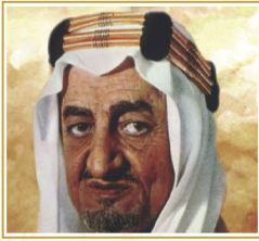
King Faisal ibn Abdulaziz Al-Saud -may Allah's mercy be upon him-