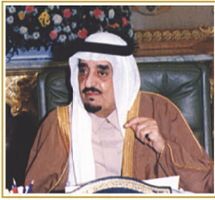
King Fahd ibn Abdulaziz Al-Saud -may Allah's mercy be upon him-