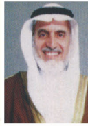
Dr. Abdullah Naseef