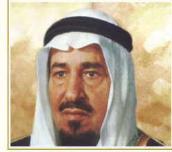
King Khalid ibn Abdulaziz Al-Saud -may Allah's mercy be upon him-