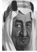
King Faisal (may Allah's mercy be upon him)