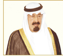
King Abdullah ibn Abdulaziz Al-Saud -may Allah's mercy be upon him-